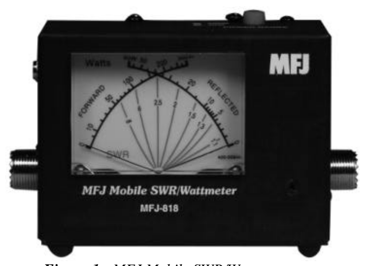
Figure 1: MFJ Mobile SWR/Wattmeter

The MFJ-818 Mobile SWR/Wattmeter measures forward and reflected power and SWR simultaneously and is designed to operate on 1.8-30 MHz. The MFJ-818 has two power scales, which are selected with the top panel push button switch. The high power scale measures 0-300 Watts forward power and 0-60 Watts reflected power. The low power scale measures 0-30 Watts forward power and 0-6 Watts reflected power. The MFJ-818 utilizes a large illuminated three-inch Cross-Needle meter to read the SWR from 1:1 to ∞. A slide switch turns the back light on or off. This compact SWR/Wattmeter is rugged enough to take the abuse of brutal mobile and portable operation.